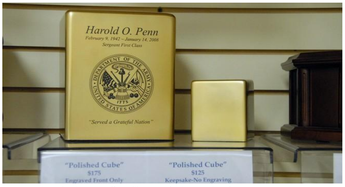
Veterans Funeral Care in Clearwater offers military urns for the cremation of veterans.

Florida is home to seven national cemeteries. All but the St. Augustine National Cemetery still have space for interments. The expansion in Sarasota includes a new administrative office building, a new maintenance facility, a ceremonial area, roads and drainage and landscaping. In all, the project will take up about 75 acres. The project also adds an electronic grave site locator and a memorial wall. Officials estimate that at least 378,000 veterans live within 75 miles of the Sarasota National Cemetery and the closest national cemetery, open to burials of casket and cremated remains, is the Florida National Cemetery in Bushnell, 110 miles north of Sarasota. The Bay Pines National Cemetery in Pinellas County has limited space and only can accommodate cremated remains. The sprawling Florida National Cemetery in Bushnell covers 500 acres of woods and rolling hills. Since opening in 1988, more than 100,000 veterans and their family members have been buried there. There are 131 national cemeteries in 39 states and Puerto Rico. More than 3.5 million veterans of every war and conflict are buried in national cemeteries on more than 19,000 acres of land. [Source: Tampa Tribune Keith Morell article 20 Feb 2011 +++]